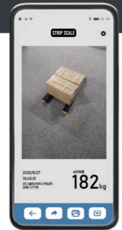
Photo & share

(if you need more functions, please contact with us)